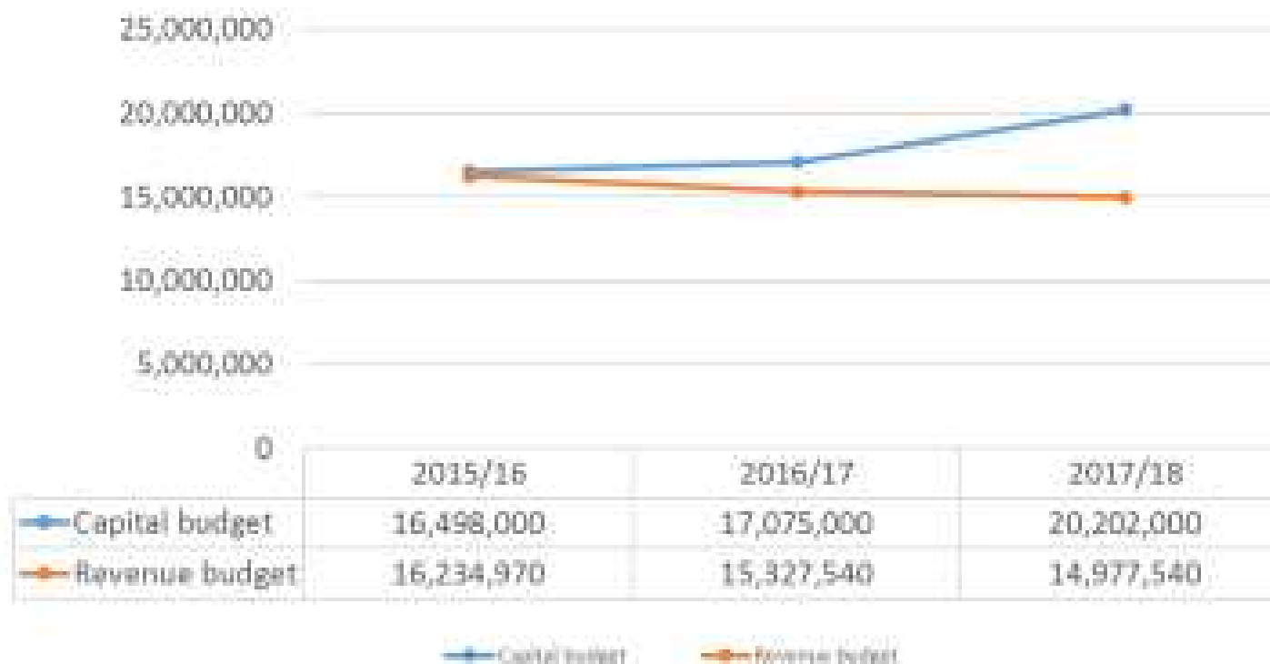
Trajectory of Revenue and Capital Budgets